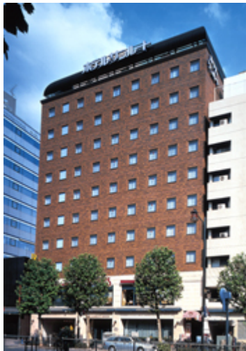
Hotel Sunroute Asakusa